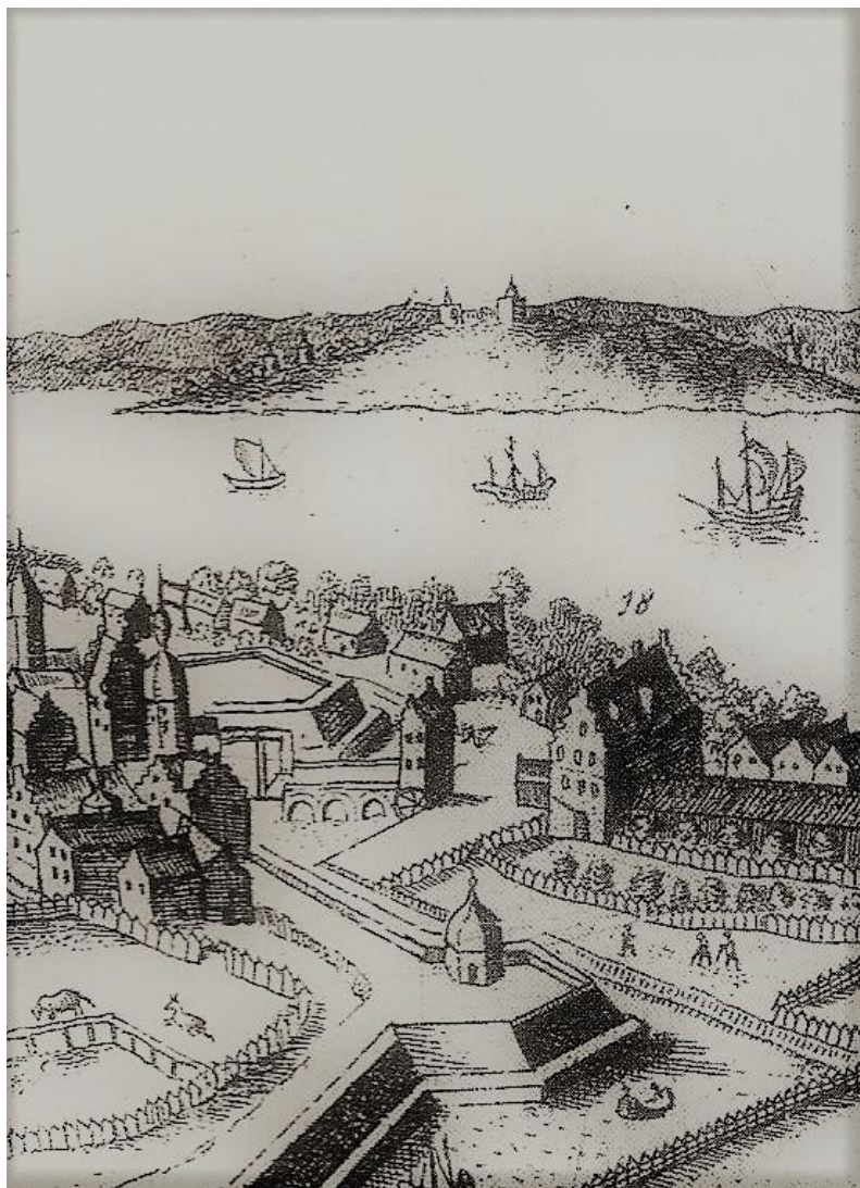
Fig. 264. Part of Johan van Wijck's painting and prospect from 1611 showing Østerport including inner- and outer gate buildings and drawbridge. The Spangenberg's characteristic bastion just north of Østerport is just visible behind the new gate building and is shown as a large, earth-filled plateau with surrounding parapets. A berm is shown by the moat.

The two buildings probably had two floors, their further appearance, however, is unknown. In 1638–1639 AD the inner gate building was equipped with a powder tower (Lassen 1855:22-27) as seen on figure 264. Southeast of the inner gate a dam was constructed in 1607–1608 across the moat with two block towers in the middle.