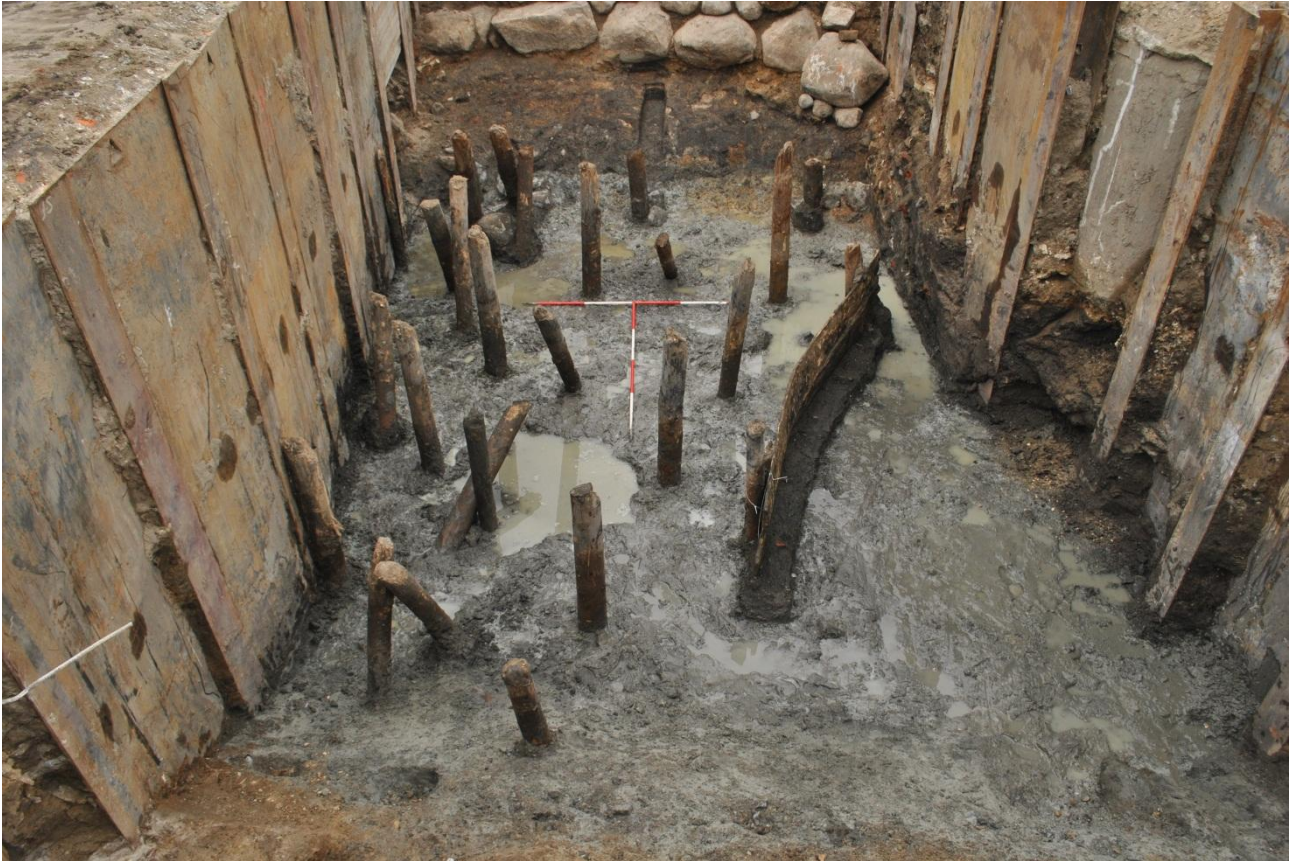
Fig. 252. Bridge structure, facing west.

The posts had been knocked/driven into the ground, and the tops had originally been flat. The points were 4 sided and tapered (0.4-0.5 m long), shaped by axe and with frayed base, probably from being rammed into the ground.