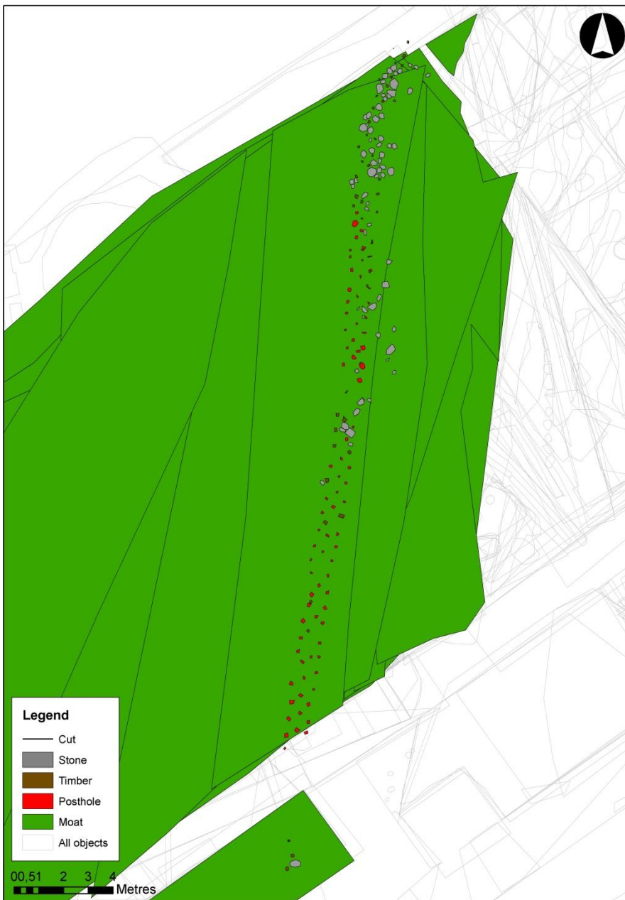
Fig. 256. Alignment of wooden poles, stones and postholes running N-S along the edge of the 17 th century moat.

The vertically set posts were 0.75-1.37 m long with four sided tips. As a continuation of this, N-S running group (G-6571) was later recorded representing an alignment of a total of 82 vertical postholes with tapered bases (ST192561). The overall length was c. 22.0 m and width 1.0 m (Fig. 257 and 258).