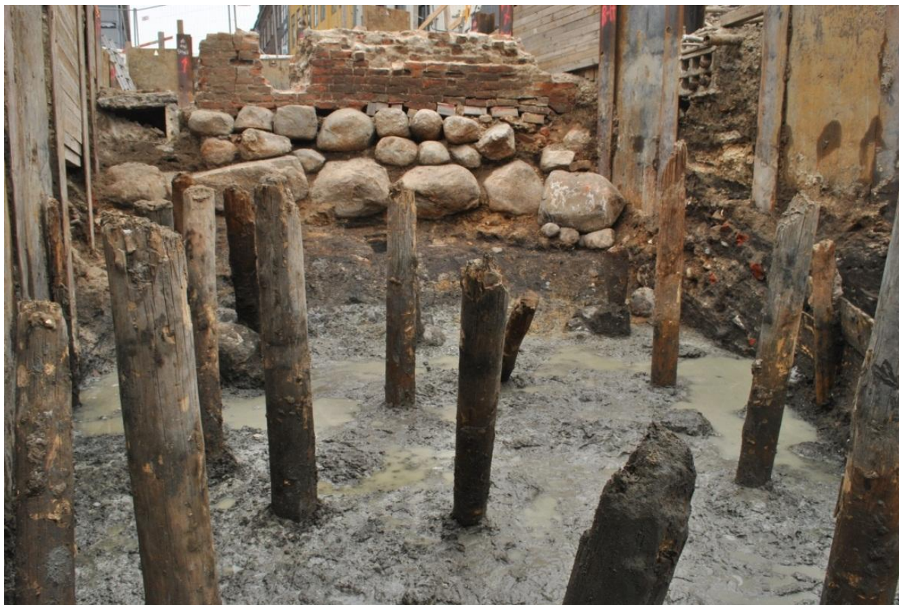
Fig. 269. Overview of the bridge structure in the Late medieval moat, facing west.

In connection with the new bridge one needed a temporary entrance into the city. In 1618–1619 a 30 fathoms bridge entering through an arch down to the beach opposite Slotsherrens gård at Østerport is mentioned (Thorsen 1926:237 and 247), which is presumably the same bridge investigated at the end of Lille Kongensgade in 2011 (Fig. 269).