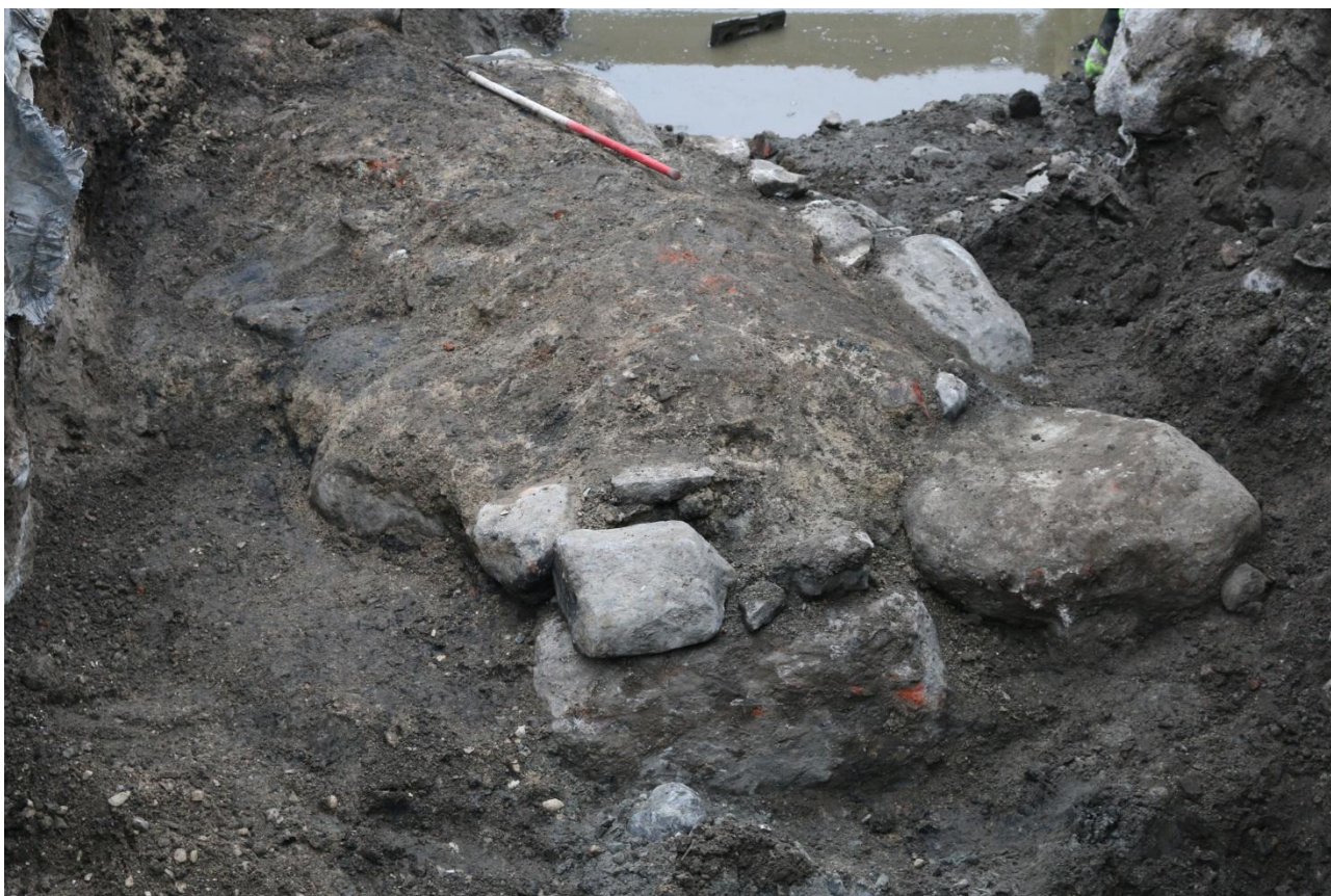
Fig. 239. Bridge pillar No. 5 with foundation stones and mortar/brick core, facing NE.

Bridge pillar No. 5 was exposed approximately 5 metres east of pillar No. 4 and consisted of a rectangular foundation (SS318865) built of natural grey stones and boulders of very varied size, where the smallest stones had been used in the core. The structure (c. 4.0 x 2.2 m) was built as two uneven rows of stones, running NE-SW, with only the outside faces straight (Fig. 239). There seemed to be only one course of systematically placed boulders, although there were a few stones in a lower layer (recorded on site before machining). The boulders were uneven in size and shape and varied from 0.7-1.4 m. Some smaller stones could be seen on top of the boulders making the surface on top flatter. The building material was unworked, natural boulders, either beach stones or glacial erratics. A total of seven boulders were recorded, but there were more, since the structure continued beyond the trench to the north. Due to measuring problems (the bridge pillar was exposed deep down in a narrow Ventilation Shaft) records for all stones and boulders were created later in IntraSiS based on measurements on site and from images.