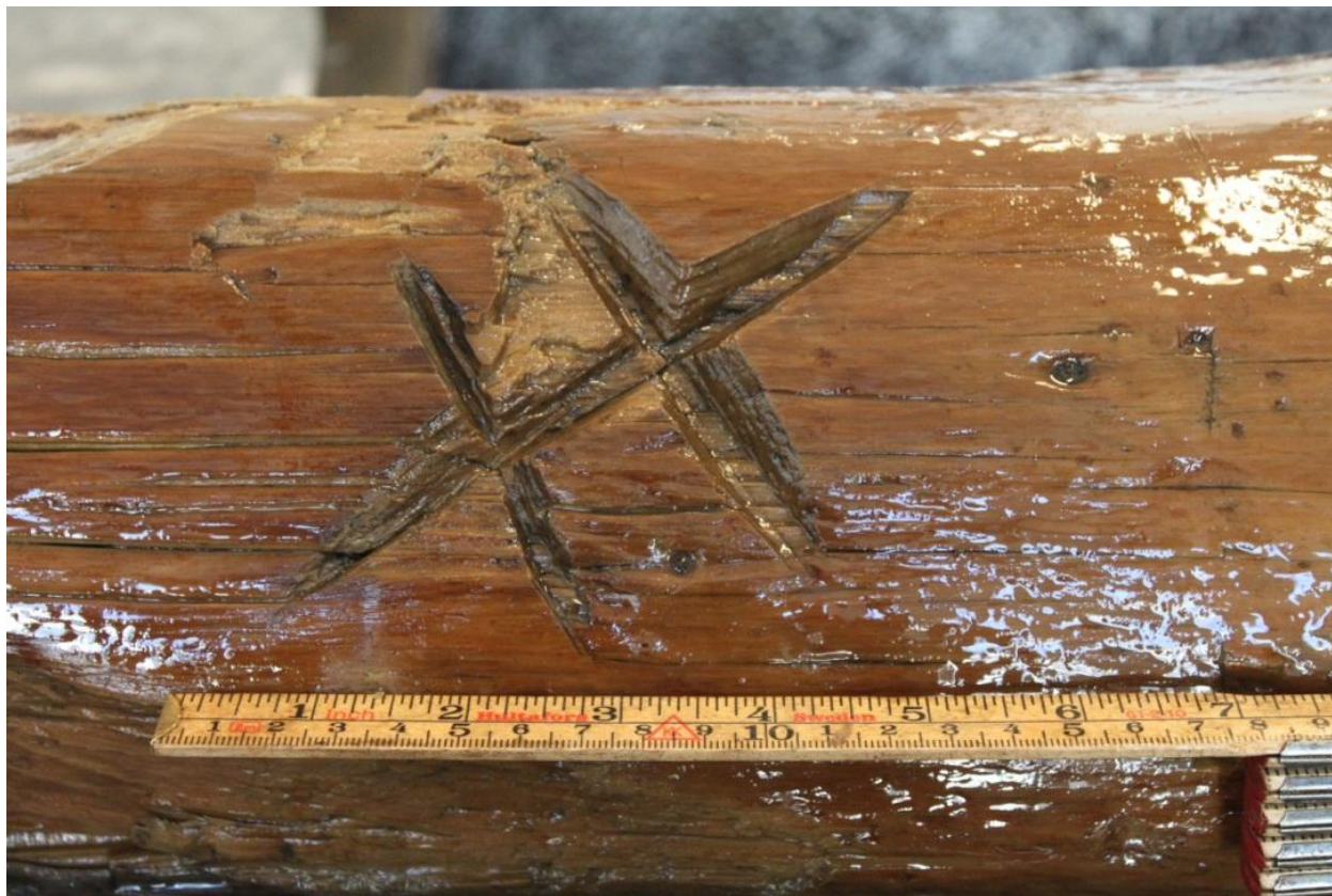
Fig. 255. Producer’s mark on one of the posts (ST65486) in the 17 th century bridge.

The lower relationship for all posts in subarea phase 5B-2 was SD143984, because this was one of the lowest deposits in the moat and equivalent to SD68352 in phase 5B-1. Some of the posts were related to a cut, due to variations in the soil around the posts, and were initially thought to be cuts with fill differing from the surrounding layers. One of the timbers had a producer’s mark consisting of a double cross (Fig. 255).