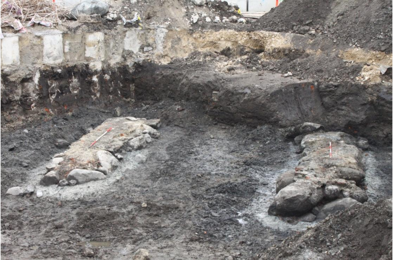
Fig. 236. Overview. Bridge pillar Nos. 3 and 4 surrounded by dark waterlogged moat sedimentation, facing SW.