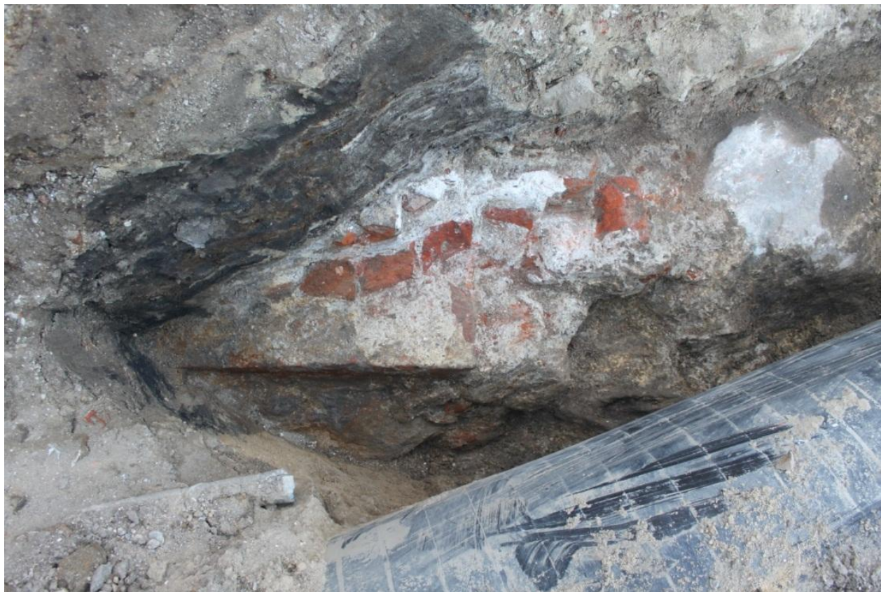
Fig. 243. Exposed part of the barrier tower including a brick wall and foundation (SS177019) covered by lensed deposit (SD177015), facing east. To the right and upper corner – part of interpreted robber cut (SC177008) filled with CBM rubble, mortar and clay.

The tower was first investigated in 2012 and seen in the NW section of a modern central heating pipe trench, truncated to the SE by the latter (Fig. 243).