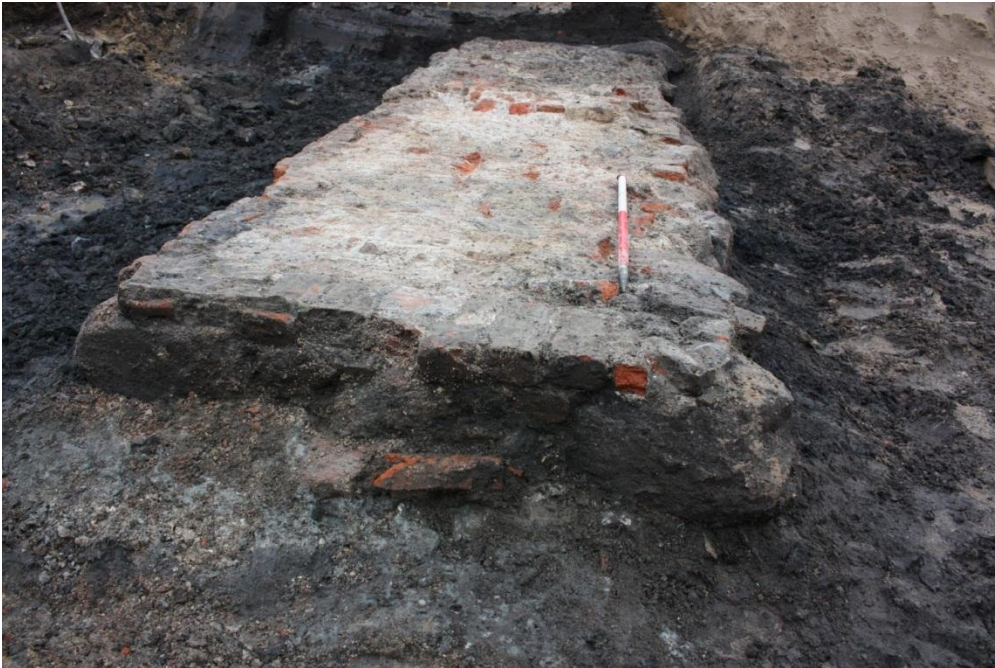
Fig. 267. One of the bridge pillars in the moat. Brick core (SS305876) with header coursing, facing north.

Five vertical brick pillars or bridge piers were investigated in the moat (Fig. 267). Part of this bridge structure was also recorded in 1994 consisting of a dressed stone plinth with three dressed stones and masonry of medieval bricks and lime mortar on a foundation of boulders and demolition material from the 16 th century or later, revealed in the street outside Kongens Nytorv No. 21. The dressed stones were sloping 15-20 degrees (Skaarup 1994).