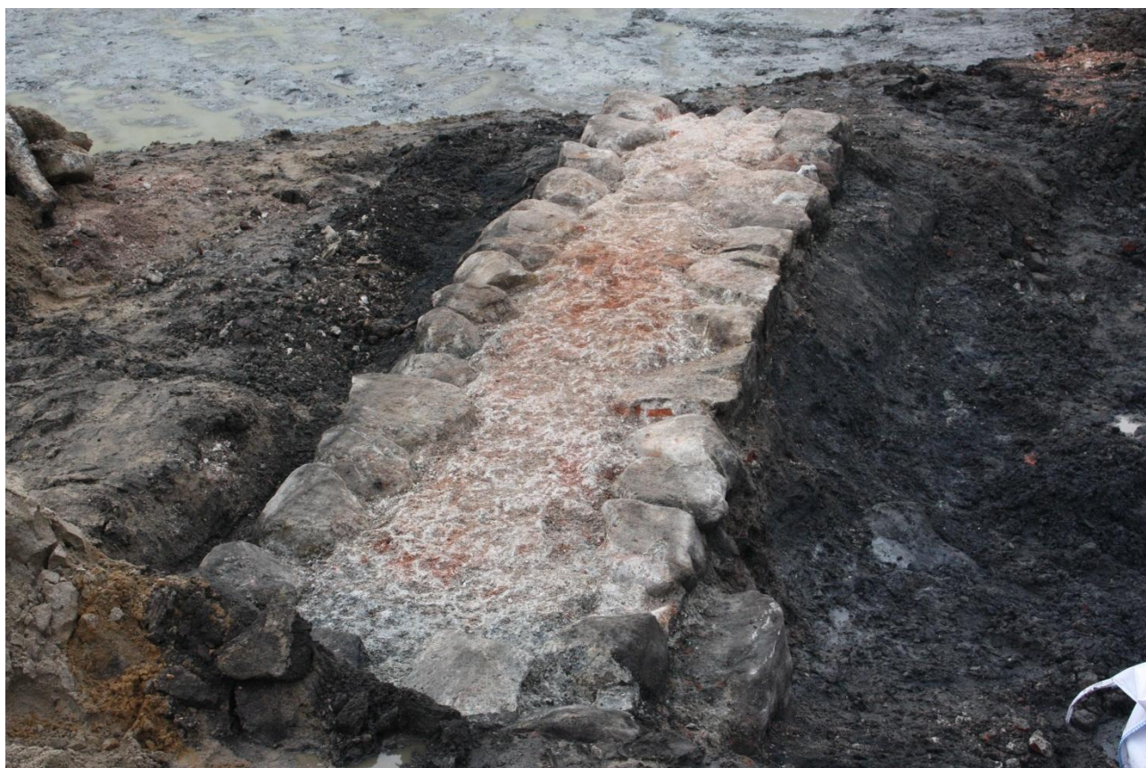
Fig. 234. Foundation stones SS305000 and mortar core SS305876, facing south.

The core consisted of 3 separate layers. SD304582 consisted of mid yellow white cemented sandy silt with inclusions of red brick fragments, stones, pebbles, wood and mortar. The bricks did not lie in order, but had been pushed and jumbled together. The bricks varied in size (0.08 x 0.06 x 0.04 m) representing medieval so-called “munkesten”. Context (SS304724) had parts where the bricks had been deliberately placed intact in position – in other parts the bricks had been mixed with stones and mid yellow smooth mortar. The upper part of SD305876 consisted of a rectangular box of red bricks (“munkesten”), with cemented grey/yellow mortar with inclusions of charcoal (from burning limestone) and pebbles (Fig. 234). The bricks were placed as a header course above the first layer of foundation stones to create a smooth surface for the next level of ashlar stones. The lower part of the context (not separated on site) consisted of cemented white/yellow mortar with crushed brick fragments between and above the foundation stones.