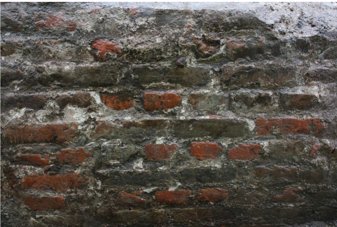
Fig. 246. Close up of brick wall (SS313218) of Dutch or English cross bond, facing NW. This bond has alternating stretcher and header courses, with the headers centred over the midpoint of the stretchers, and perpend in each alternate course aligned.