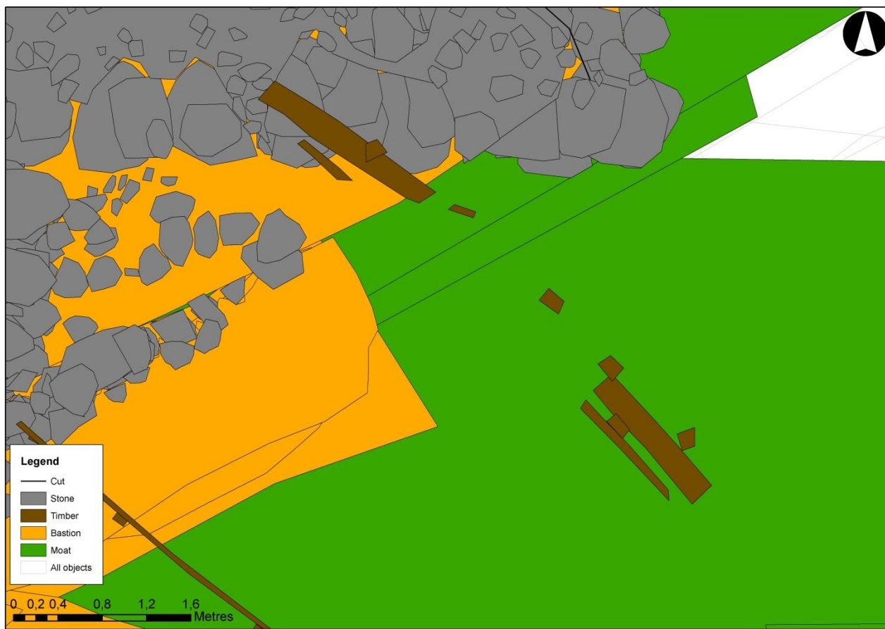
Fig. 260. Interpreted sluice of timber posts and planks partly underlying the 17 th century bastion.

Horizontal plank (ST310171) was 5.4 m long and 0.2 m wide and placed parallel to planking (ST310200) in a NW-SE direction. The NW end was clean, sawn cut, whereas the SE end was broken – possibly the result of a modern break. The timber structure was destroyed in the middle by modern concrete forming the Guide Wall. Plank (ST311593) further to the west had the same orientation, was 3.12 m long, worn and slightly ripped at the ends. The plank was placed right up against two upright posts (ST311599 and ST311603), but no fixings were visible (Fig. 261).