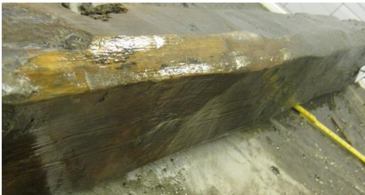
Fig. 259. Post No. 40 with big facets that might have been made with an axe of the same type as the broad axe found in the moat (see FO501815; Fig. 227 above). From Melin 2014:15.

Some of the timber from timber structure (ST191422; G-240090) was analysed with respect to woodworking techniques (Melin 2014). The greater part of the posts had been made of fast grown spruce using the top timbers, where the timber logs closest to the ground had been used for something else – although some of the posts might have been made of young fast grown spruce with an overall small diameter (Fig. 259).