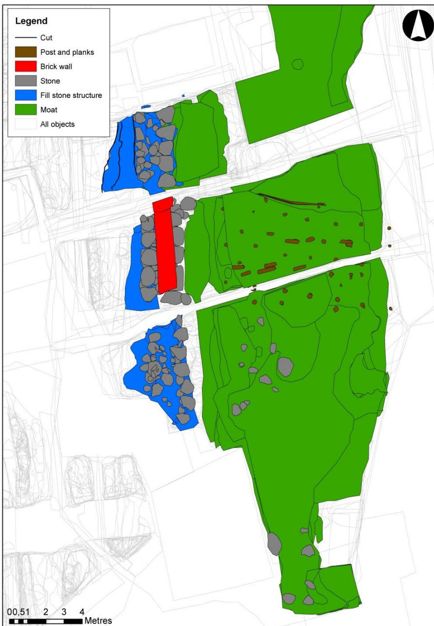
Fig. 251. Temporary bridge in the Late medieval moat with the medieval city wall to the left.

The bridge (G-446) consisted of 44 circular vertically set and tilting posts with removed branches and stripped bark which varied in length from 0.92 m to 2.80 m and horizontal planks laid edge on (Fig. 251-253).