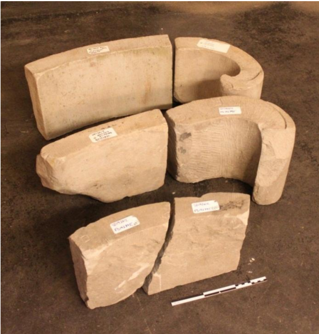
Fig. 271. Parts from former Østerport? Early post medieval sandstone ashlars from the 17 th century moat.

the 17 th century moat originates from the same building (Fig. 271). The dating is early 17 th century and the ashlars could represent destruction material from the former Østerport, although this proposal is highly uncertain.