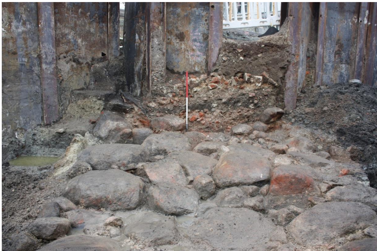
Fig. 242. Part of dam structure and section C204494 with overlying demolition material and rubble, facing NW.

South of and parallel to the dam foundation four posts and postholes interpreted as part of a scaffold cut the moat's alluvial layers, which prove that the dam was a later addition within the Late medieval moat. Finds collected from the stone structure and foundation layers consist of ceramics (Late redware; 1450–1800 AD and 1550–1650 AD), limestones, bricks, iron, slag and bones (pig and unspecified mammals), which argue for a date for the dam of around 1600 AD.