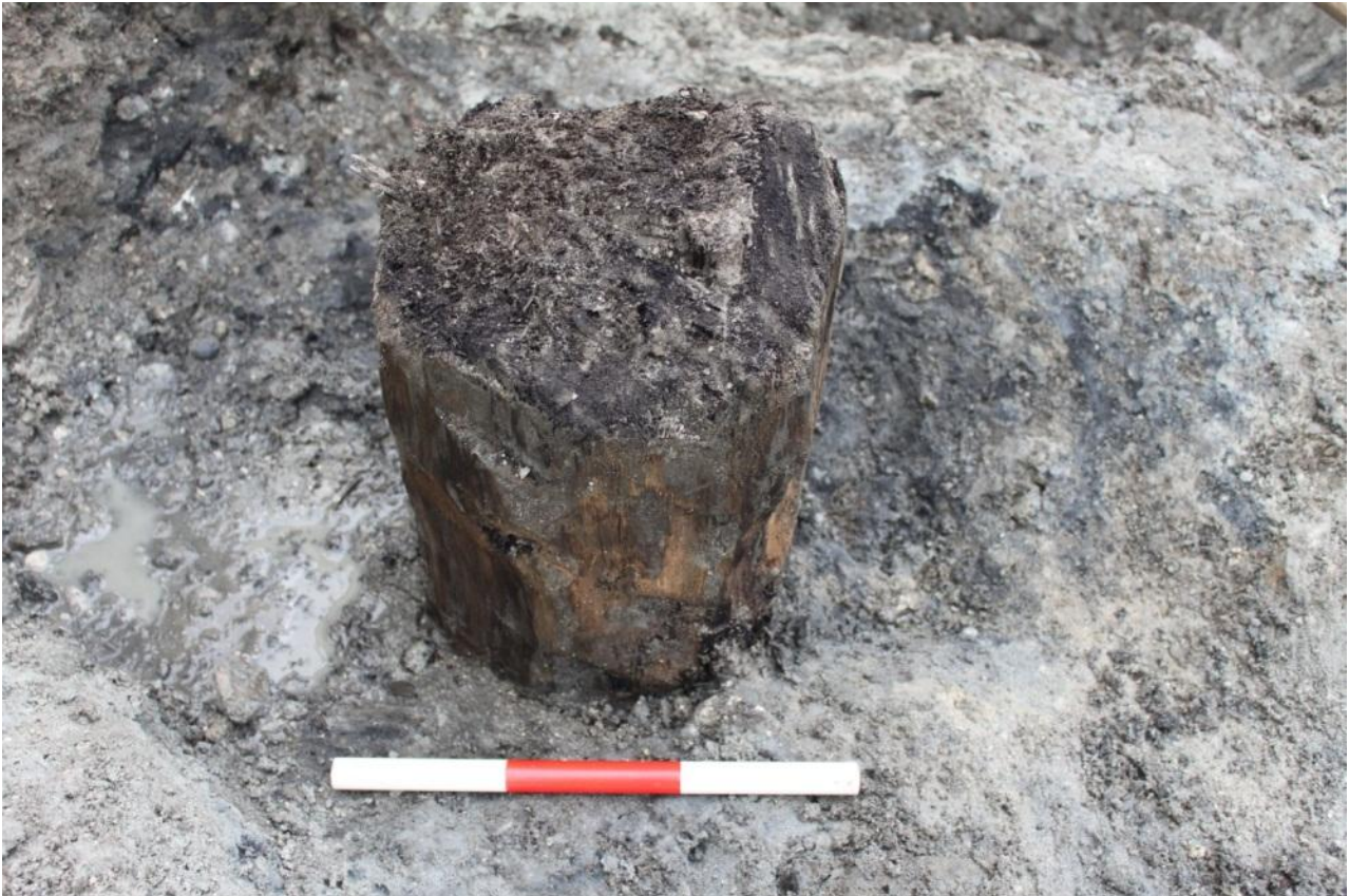
Fig. 263. Post No. 2 (ST198467) driven into the natural substrate, facing north.