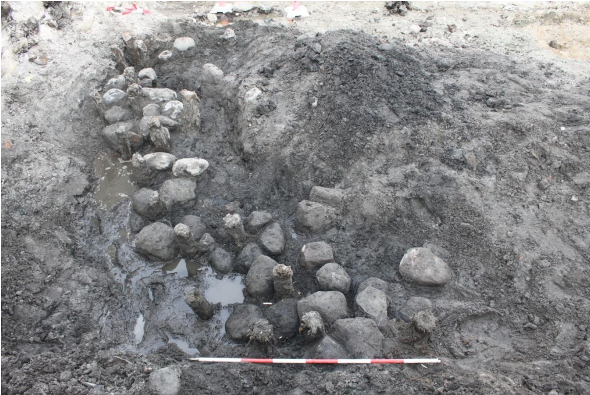
Fig. 257. Part of revetment. Wooden posts (ST191422) and stones (SS191511), facing NW.