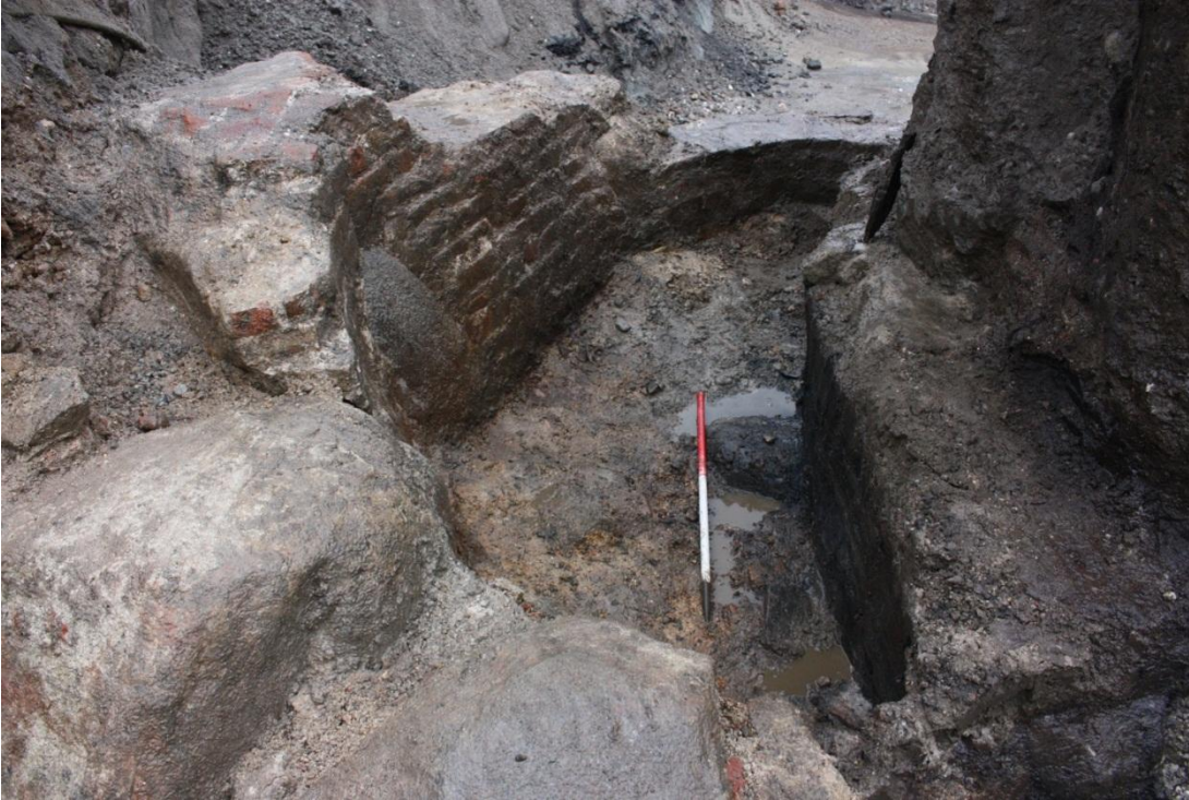
Fig. 245. Remains of the barrier tower with foundation stones and curved brick wall (SS313218), facing north. To the right – section through dark alluvial deposits inside the structure.