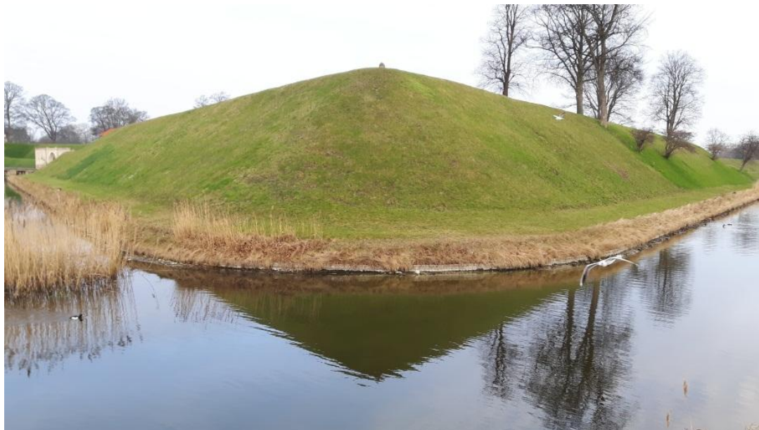
Fig. 266. Bastion and berm facing the moat at the Citadel in Copenhagen.

rampart reached the height up to 11 cubits. Moreover, the rampart was equipped with a two metre wide berm (Westerbeek Dahl in press).