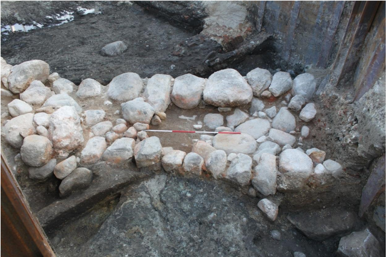
Fig. 241. Dam structure. Excavation of upper course (SS18545), facing SW showing carefully placed boulders to the north and south.

The bonding material in between the boulders consisted of strongly cemented CBM (mostly red brick rubble mixed with mid grey mortar and sand). On top of the outer course at the eastern end it was still possible to identify remnants of proper bonding mortar in situ.