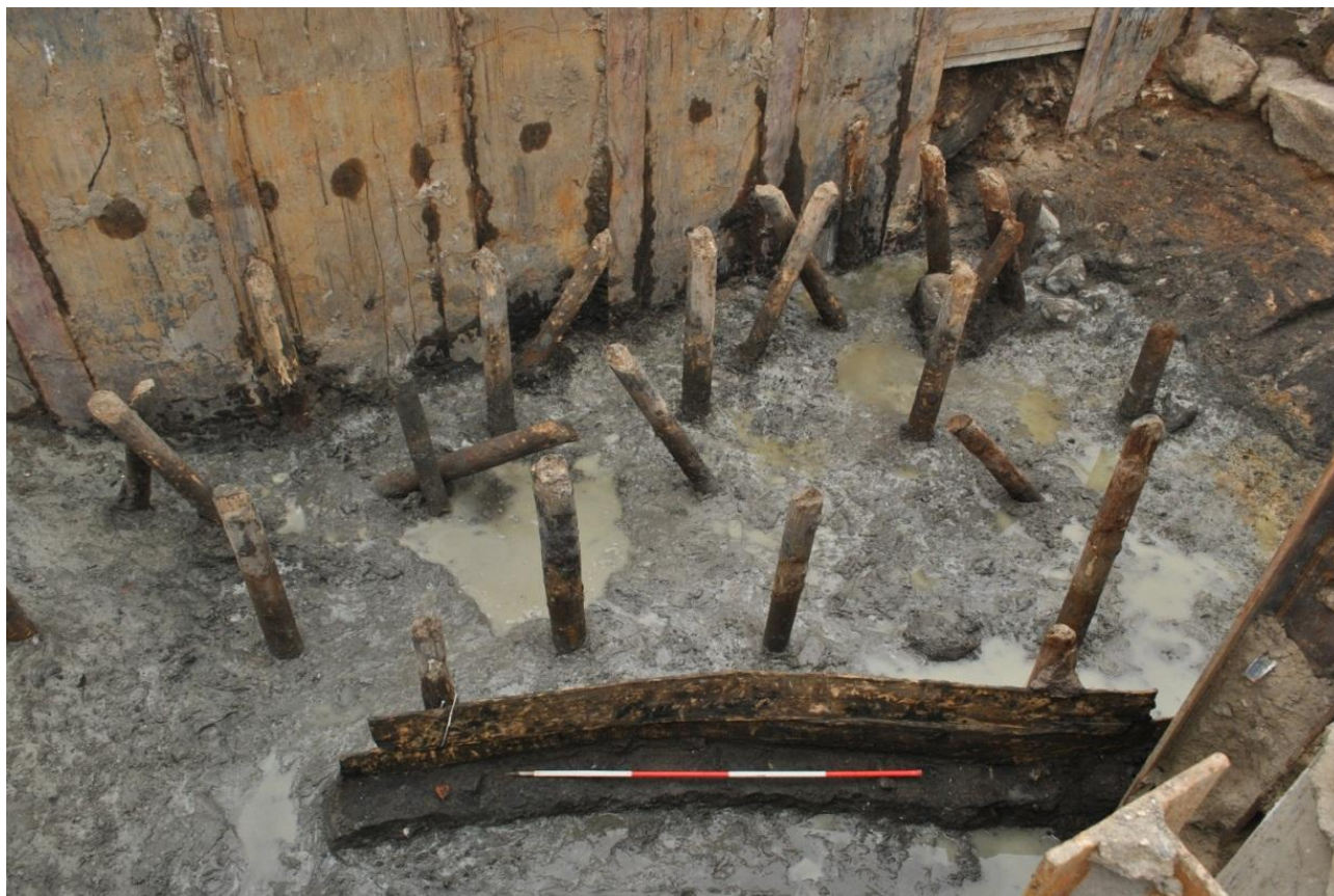
Fig. 253. Bridge structure with planks ST70114, facing SW.

The upper plank and the lower plank were slightly out of place. They had bowed shapes, perhaps having warped prior to the filling up of the moat. There was a round headed iron nail driven through the north facing side of each plank near their eastern ends. These nails had a diameter of 0.02 m and were located roughly adjacent to each other. The nail in the upper plank was recorded 0.71 m from the eastern end of the timber and 0.09 m from its upper edge. The nail beneath in the lower plank was placed 0.94 m from the eastern end and 0.14 m from its upper edge. The stout post (ST65064) lay a short distance away from these nails, a little further to the east. It is likely that the planks were again fastened to this post with these nails, before the structure warped, tearing the planking away from its original position. The warping of the planks gave rise to the upper section occasionally overriding the bottom plank and vice versa.