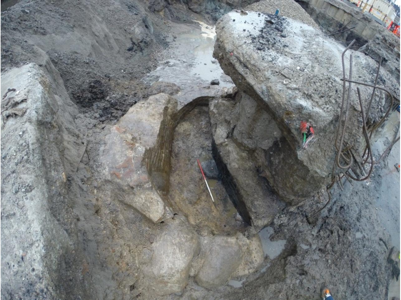
Fig. 244. Barrier tower from above pierced by a modern concrete pillar to the east.

In 2014 the rest of the barrier tower was fully exposed (Fig. 244). Foundation SS311800 and SS503426 consisted of a semicircular structure of unfinished mid grey granite boulders and stones with infill of mortar and CBM. Two of the stones, facing east, had worked surfaces similar to the worked stones seen in the bridge pillars further to the east.