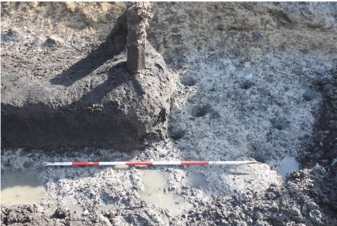
Fig. 258. Part of posts ST191422 with continuing postholes ST192561 (G-6571), facing east.