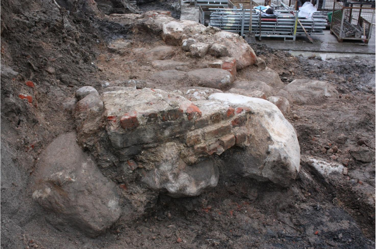
Fig. 248. Curved brick wall (SS311742) placed on and matched to boulders (SS503426), facing NW.

Square blocks SS311725 and SS311734 consisted of three courses of medieval red bricks (“munkesten”) with white tuck mortar within foundation SS503426 (Fig. 249). The blocks are interesting – the shape and the finished edges suggest that these represent the lower part of merlons, reused as building material when the city wall was demolished in the early 17 th century. A merlon is the solid upright section of a battlement or crenellated parapet in medieval architecture or fortifications.