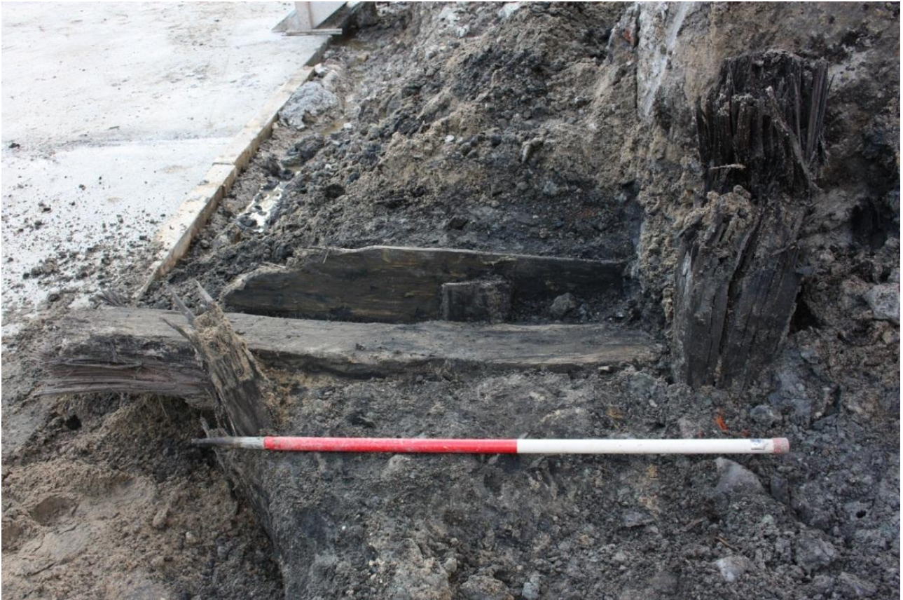
Fig. 261. SE part of wooden structure (G-503381) consisting of vertical posts and horizontal planks at the base of the moat, facing SW.

Since the features were exposed by machine (Watching Brief 2014) without clear contextual relations the interpretation is difficult, but the suggestion is that the construction could represent some sort of small sluice in the 17 th century moat used to power a waterwheel. However – one should note that a sluice is depicted on Thorsen's reconstruction drawing of the 16 th century fortification and Østerport, despite the existence of obvious inaccuracies (Fig. 152, Chapter 16.2) – so there is a possibility that the feature could represent remains of this timber structure.