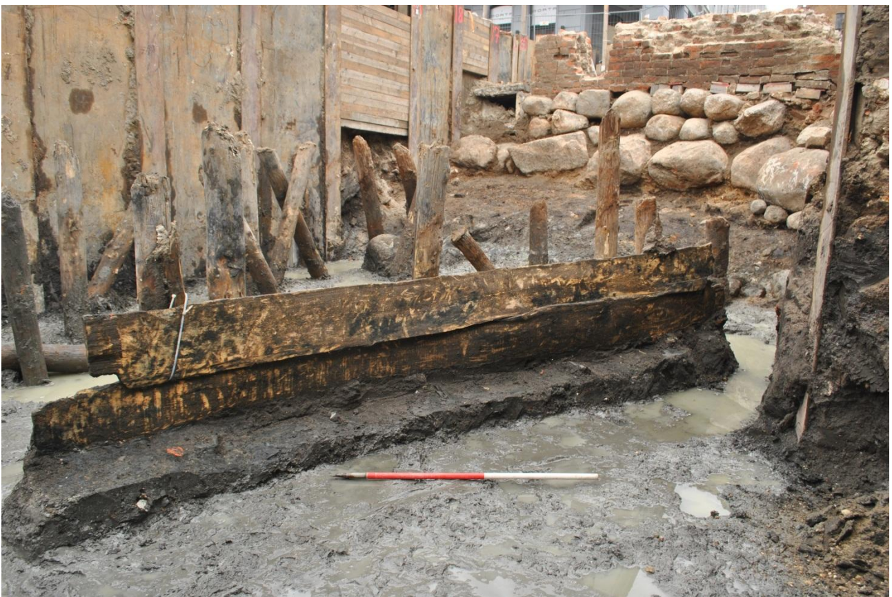
Fig. 254. Upper and lower plank ST70114 on top of alluvial deposit SD68352 in the former moat.

There were four posts from the bridge structure and a horizontal edge on plank (ST70114) that were not driven into the natural ground. Primary fill and alluvial layer SD68352 was sealed under the plank ST70114 and the four posts all had their tips bedded in this layer. This means that it was most likely that layer (SD68352; SG-727) was present in the moat before the bridge was built.