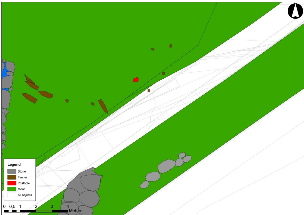
Fig. 262. Vertical posts and bulwark for a larger nearby structure (?) documented at the base of the moat in the natural substrate. The horizontal planks belong to later robber activities; G-810 (see above).

The beams were driven into the natural substrate at the base of the moat cut. Only four posts could be removed from the ground. Two posts were disturbed, possibly by machine, and recorded as lying flat approximately where they were originally placed. The posts might represent a bulwark for the 17 th century bridge construction or a nearby structure, although the latter suggestion is very uncertain (see discussion about boulders in the moat backfill above; G-504240 and Fig. 264).