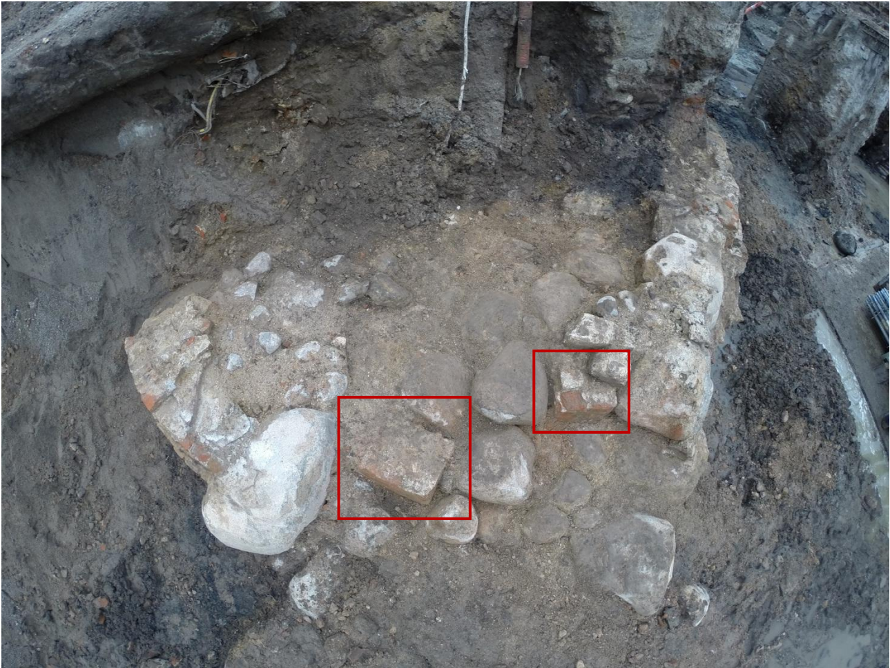
Fig. 249. Overview. Continuation of curved brick wall to the left (SS311742), foundation (SS503426) with reused merlons from the former city wall (SS311725) in the middle (within the red squares) and brick wall (SS309994) to the right.

The construction and foundation layers SD309903 and SD310094 consisted of mortar and firm greyish blue clay mixed with a large amount of CBM. Levelling layer (SD313535) in the interior of the tower structure was disturbed by a modern concrete pillar in the centre (Fig. 244), so only a small portion of the layer was visible and preserved.