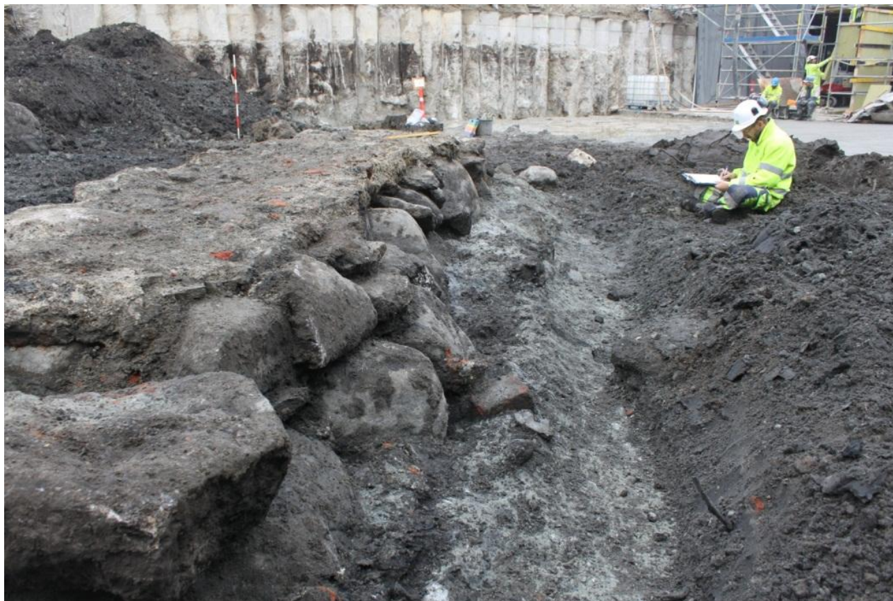
Fig. 238. Documentation of bridge pillar No. 4, facing north. On the right side one can see that the moat itself has been dug deeper around the pillars with the surrounding and natural clay becoming part of the foundation.

Cut SC303632 consisted of a NE-SW oriented, flat depression between bridge pillar Nos. 3 and 4. The distance/width was 2.5-3.0 m but the length was not clarified due to machining. This truncation represents some sort of construction cut in the natural substrate related to the moat and bridge structure. Context (SC228488) was also a landscaping event related to the bridge, but further information and interpretation is unclear. Created cut (SC302799) consisted of some sort of rectangular foundation of natural moraine around bridge pillar Nos. 3 and 4, a leftover when digging the rest of the surrounding moat (Fig. 238).