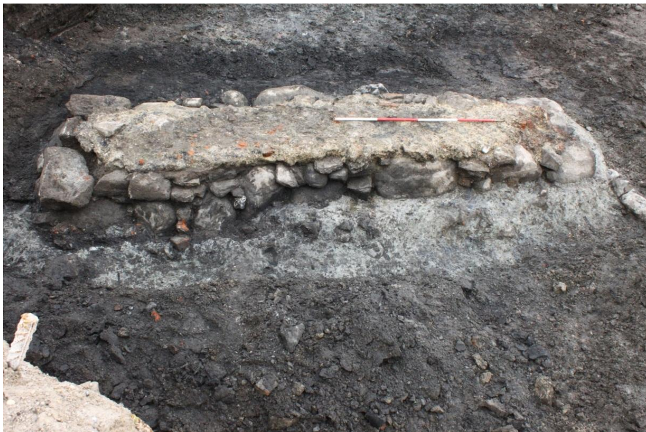
Fig. 237. Bridge pillar No. 4 with foundation and mortar core surrounded by dark waterlogged moat sedimentation, facing west.

Context (SS302213) was the first of two drystone courses within the bridge pillar foundation. The material was apparently natural stone slabs, although the edges may perhaps have been worked to create straighter surfaces. The slabs were remarkably close to being square in shape. However, the upper and lower faces seemed to be natural, unworked faces formed when the stones broke. The western part of this layer contained five stones, two of which overlay a natural boulder in the foundation, while the other three overlay a smaller natural stone in the foundation. One more stone was fitted into this surface behind (to the south of) these other stones. The stone was lying within the mortar infill and did not seem to serve any structural purpose, but was clearly part of this level and of this construction detail. On the eastern face of the foundation, six stones lying at the same level were included in the context. Two of these were naturally flat slabs (to the southwest), the others (to the southeast) were rounded and very unevenly coursed.