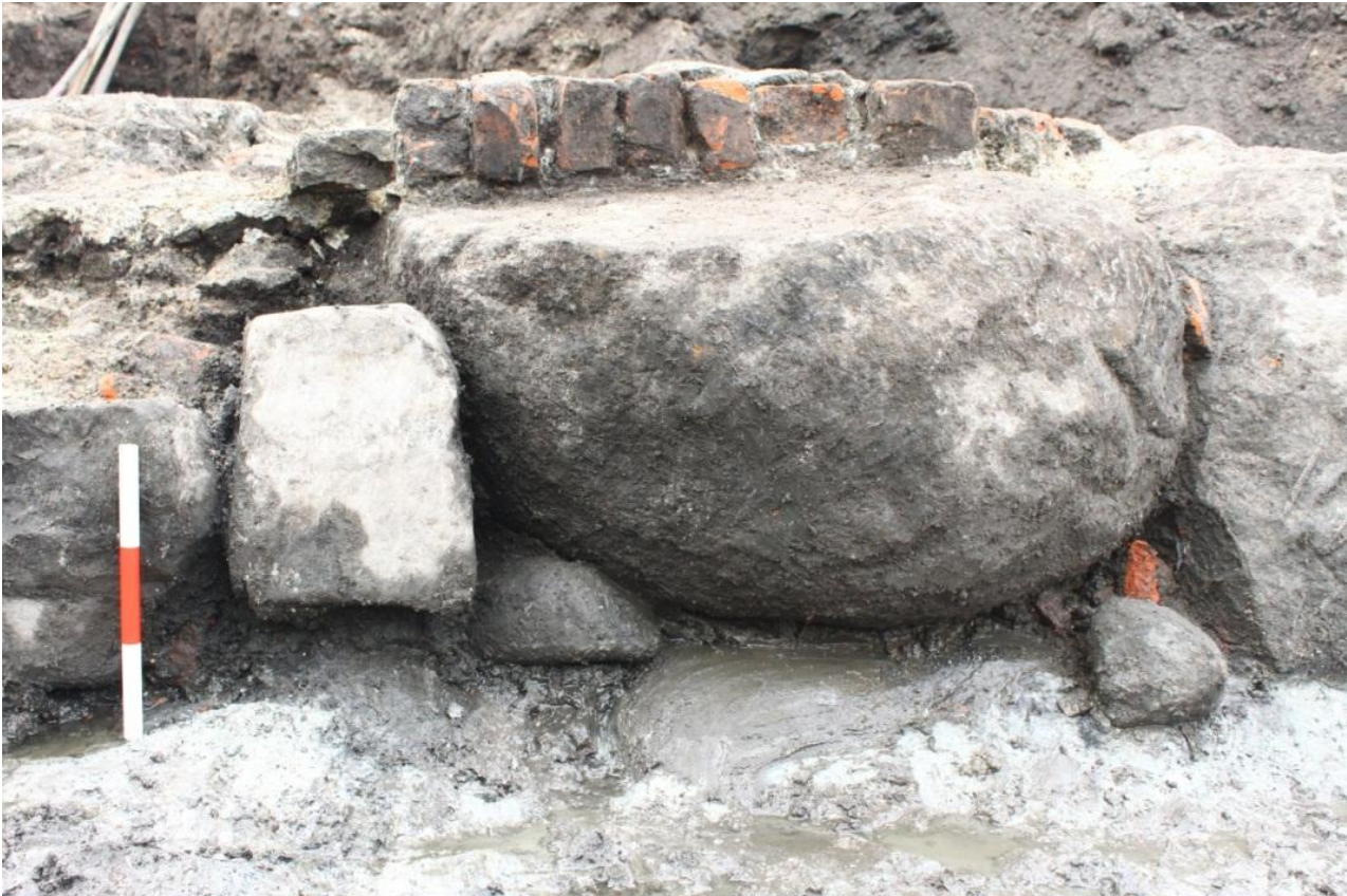
Fig. 235. Close-up photo. Upper part of foundation stones SS301585 with brickwork, facing SW.

SS301458 consisted of a fully laid brick structure on top of the foundation stones (Fig. 235). This had been destroyed while tearing down the bridge and only one course and a few red bricks in the northern end had survived. The red bricks were approximately 0.24 x 0.12 x 0.07 m, placed in headers-rowlock system and of Renaissance type (?). The type of mortar was unclear due to the poor preservation of the brick structure.