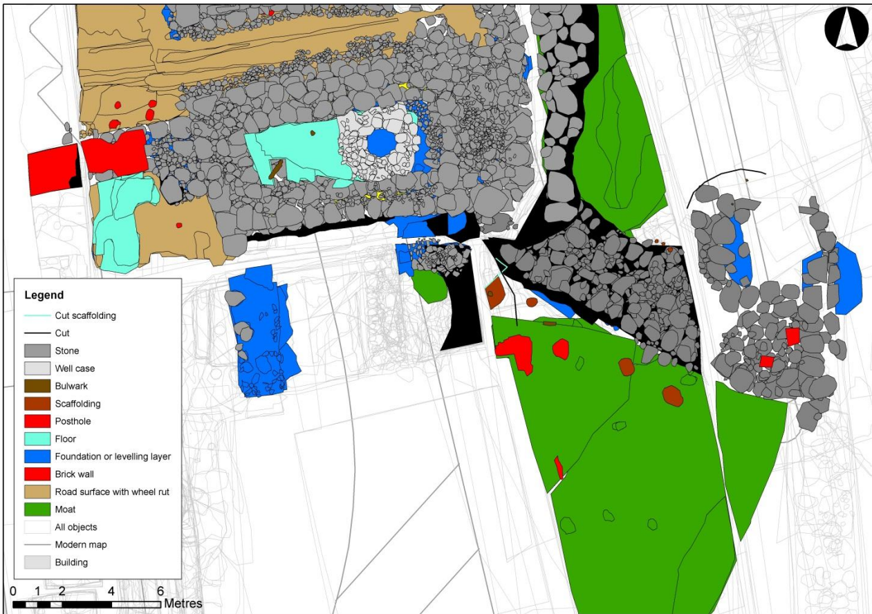
Fig. 240. Dam with semicircular barrier tower placed SW of the gate building in the Late medieval moat. The lack of stones in the middle and within the tower is due to the modern shoring and a concrete pillar erected in conjunction with the new Guide Wall. The measured moat cut to the left, inside the building should be moved two metres to the right based on later re-interpretations.

240). The upper part of the stone structure had been destroyed by looting (robber pits) in the 17 th century and by a modern NW-SE running central concrete heating duct from 1956.