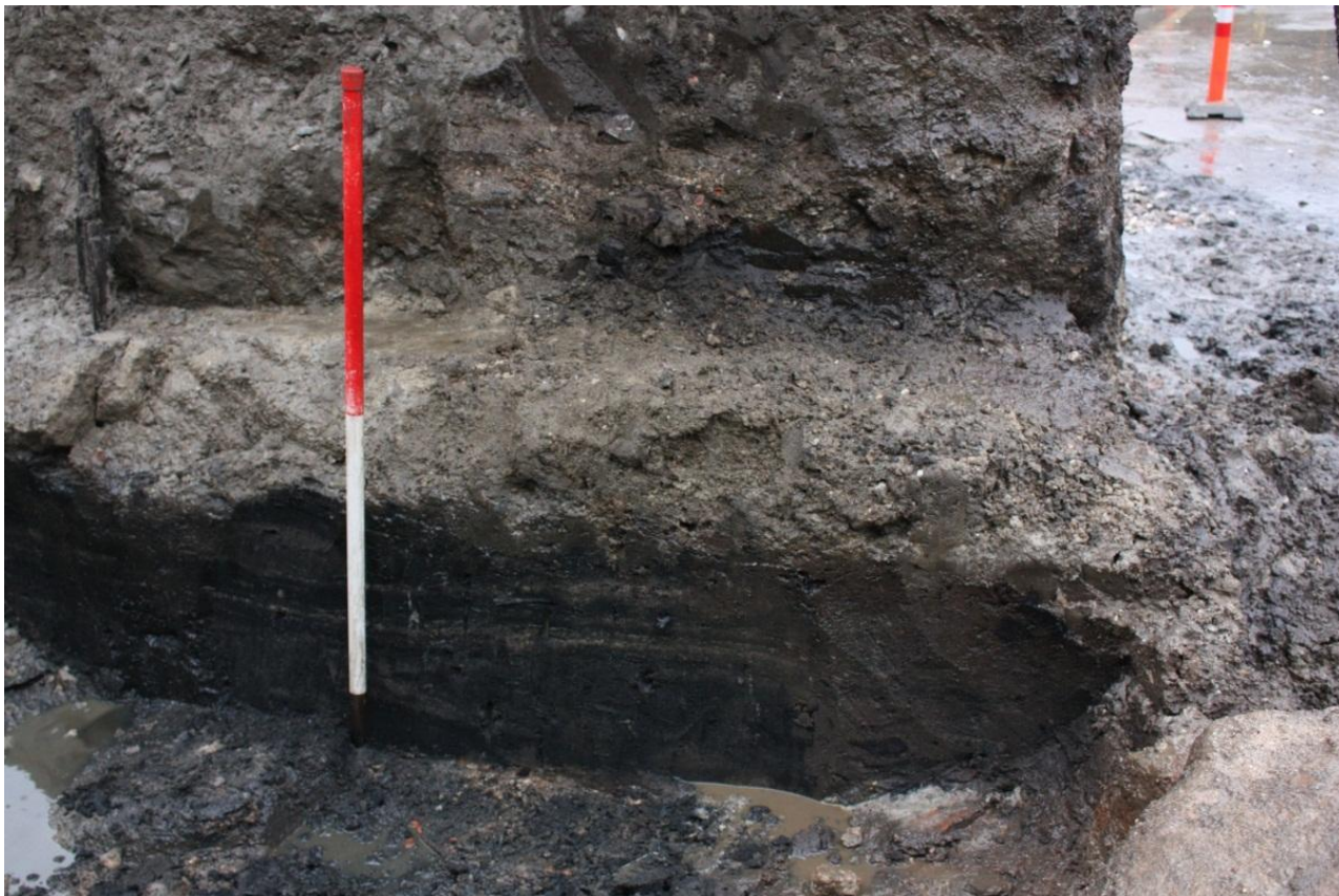
Fig. 250. Dark alluvial deposits (SD310100 and SD313522) within the subcircular structure (SG-503796), facing east.

The deposits were first interpreted as usage deposits inside the tower – although there are questions as to the accumulation process, the layers were clearly alluvial, hence to the lenses. There is therefore a slight possibility that the layers could have been created after the structure was abandoned. The demolition material associated with the tower consisted of mixed red/grey silt with inclusions of stones, pebbles, CBM and charcoal.