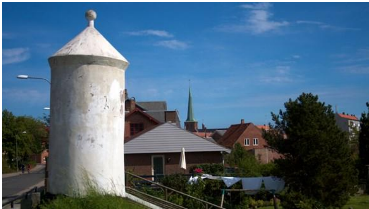
Fig. 270. Small whitewashed tower from c. 1660 AD on top of the dam at "Kongens Bastion" in Nyborg. From: Den hvide jomfru 2016. Photo: Kristian Lilholt, VisitNyborg.

In association with these dams several watermills were built to utilize the height difference created in the water table. How many mills there had been along the fortress terrain is unknown, but a watermill close to Østerport is mentioned in 1511/1512 AD (Skaarup 1996:36) and a water wheel is also displayed on the prospect from 1611 (Fig. 264). One of the first proposals of the circular structure on site was that this represented the remains of a watermill – but no material from a demolished mill (parts of milling stones, wheels, axles, paddle blades, etc.) was encountered. Round structures exist in relation to horizontal mills, but are not known in Denmark, except at Bornholm. A horizontal mill normally operates with a modest (narrow) water flow, but with a big fall and a horizontal mill's performance compared to a vertical mill is so modest that it was hardly part of fortifications of the dimensions that existed at Østerport in the early 17 th century (Fischer 2016).