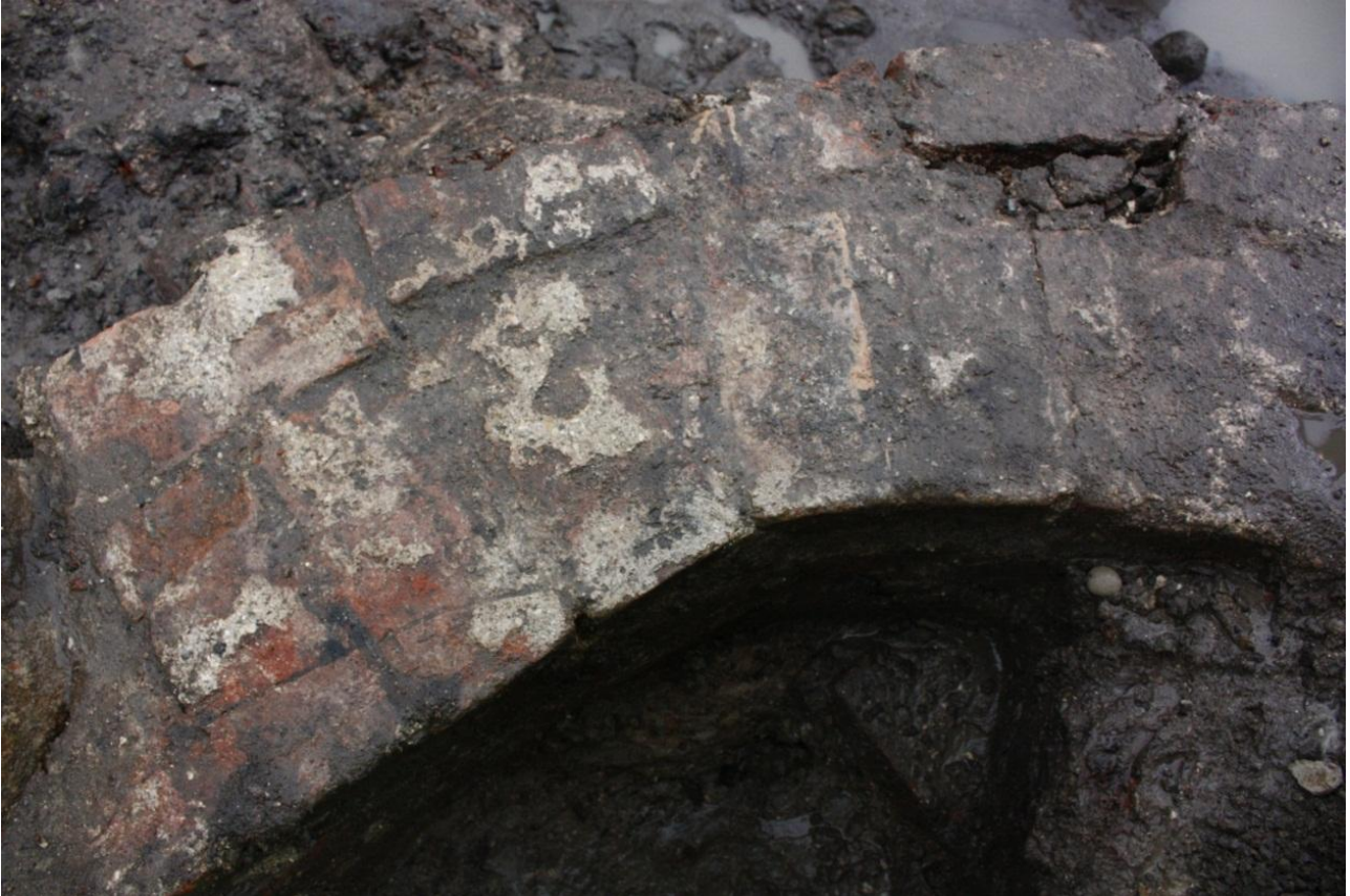
Fig. 247. Detail view of brick wall. The northern and narrower part of brick wall (SS313218) from above. Stretchers exposed and placed against the headers on the inside.

Structure (SS311742) consisted of a curving wall of fully laid medieval bricks and a single rectangular ashlar. The brick wall was 1.2 m long, 0.4 m wide and 0.5 m high with mid red bricks (“munkesten”) and yellow/white tuck mortar. The bricks had been placed stepwise (5 cm) in the lower part (Fig. 248), and one got the impression that the structure sloped slightly to the NE, but this probably was done to stabilize the construction. The brickwork consisted of both headers and stretchers, but no coursing technique could be determined on site. The bricks and ashlar stone had been placed on and matched to the foundation stones in SS503426.